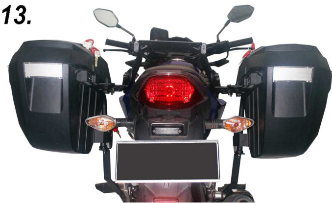
Once kit is securely installed on the right & left portion of the unit, tighten all bolts. After that Install side cases properly

SIDE BRACKET UNIVERSAL 3P KIT MASTER U0UN14IF