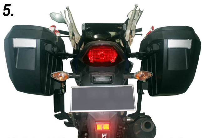
Adjust left and right position according to motorbike body then fully tighten.