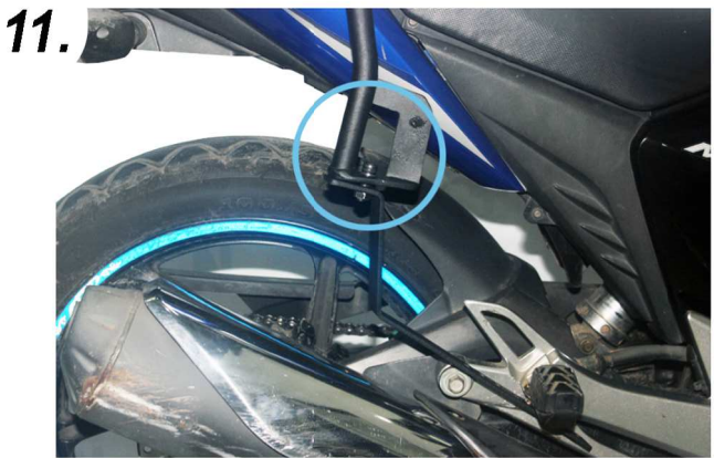
Install part No.3 to part No.1 by choose one of holes in Part No.3 , then install with part No.7/No.8.