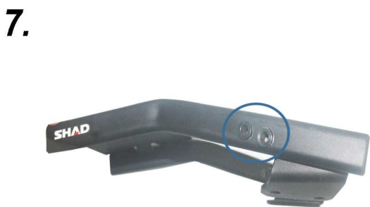
Install part No.9 in to each holes and install part No.6