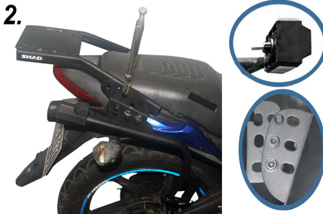
Install part No.11&12 in to part No.1 then Install part No.1 and choose few holes to assy with part No.5.