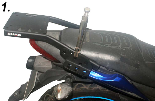
Install and adjust position of part No.2 with clamp.