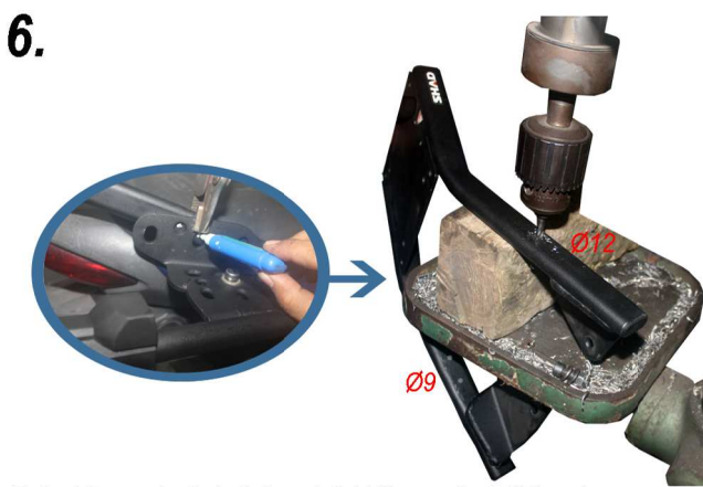
Put white marks in to left and right then uninstall the clamp. Drill Top Kits body with diameter 12mm(outside) and 9mm(inside)