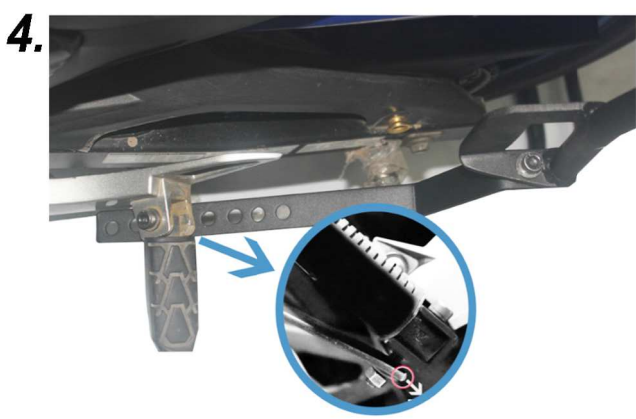
Release hinge and wire from footstep,then choose one of holes in Part No.3 and install with part No.4 and Part No.6