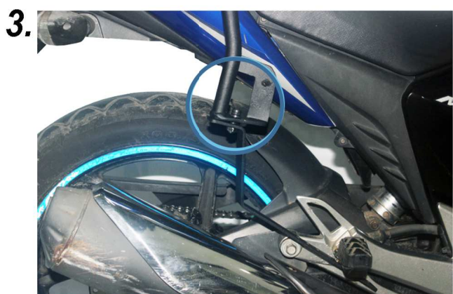
Install part No.3 to part No.1 by choose one of holes in Part No.3 , then install with part No.7/No.8.