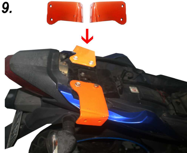
Make additional metal part to attach and connect between Part No.2 and frame motorbike