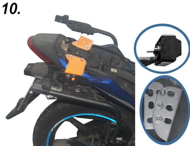
Install part No.11&12 in to part No.1 then Install part No.1 and choose few holes to assy with part No.5.