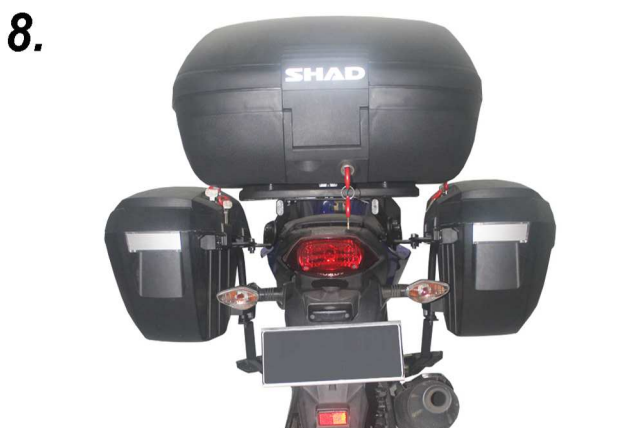
Once kit is securely installed on the right & left portion of the unit, tighten all bolts. After that Install side cases properly