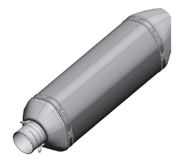
SERIAL NUMBER POSITION